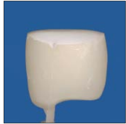
Fig 1 (Left) Image of an abutment that was shown to the participants during the survey. (Right) Image of the crown type that was provided to participants.